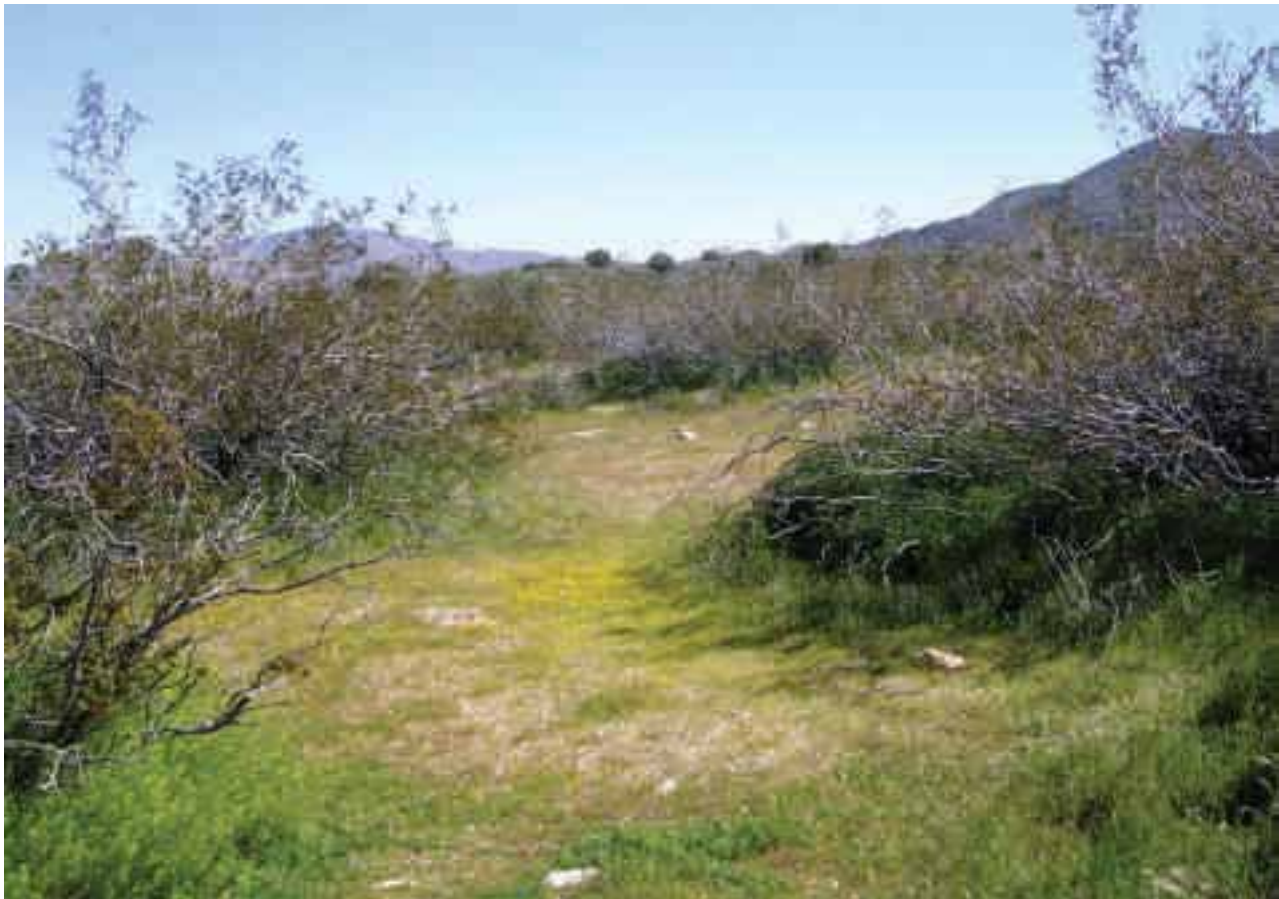
Open stand of Creosote Bush ( Larrea tridentata ) Alliance with an understory including red brome ( Bromus madritensis ssp. rubens ) and Mediterranean grass ( Schismus spp.). Recent invasion by non-native grasses increase the risk of this vegetation burning.

to the new processes. Taken more broadly, by comparing characteristics of multiple vegetation types within a large parcel of land or watershed, we can begin to understand how its diversity has changed, or has not, under current conditions. In addition, we can better understand how to conserve its diversity by grasping the role of fire and other natural processes at the landscape level.