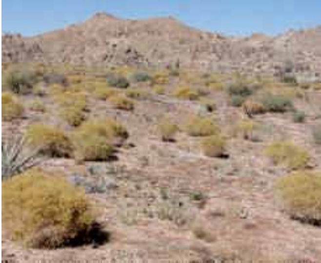
LEFT: Fires significantly reduce the shrub cover, and species such as the matchweed ( Gutierrezia spp.) and non-native grasses that thrive following disturbances dominate for many years afterwards before creosote can recover. • BELOW: Bigpod ceanothus ( Ceanothus megacarpus ) occurs in a patchwork with other chaparral in the Santa Monica Mountains in Ventura County, where fire and other disturbance modify the nature of stands.

fire affects a particular stand of vegetation) for each alliance for two main reasons. We often do not have enough data on plant responses to fire to arrive at precise fire return intervals. More importantly, natural processes such as fire influence the character of the vegetation depending on the time between events (whether a relatively short or long interval), and the pattern of the events (whether a mild understory surface or an intense crown fire). These two variables, in turn, affect the composition and structure of the resulting vegetation. So, we assign general terms (e.g., short, medium, long) in the tables. These are often